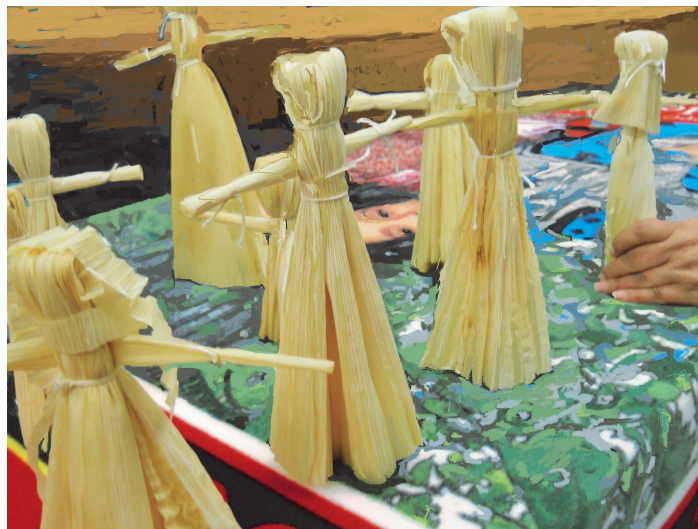
Cherokee corn husk doll display, San Antonio Public Library Photo by Anne Schuette, November 9, 2013

Photo by Anne Schuette, November 9, 2013