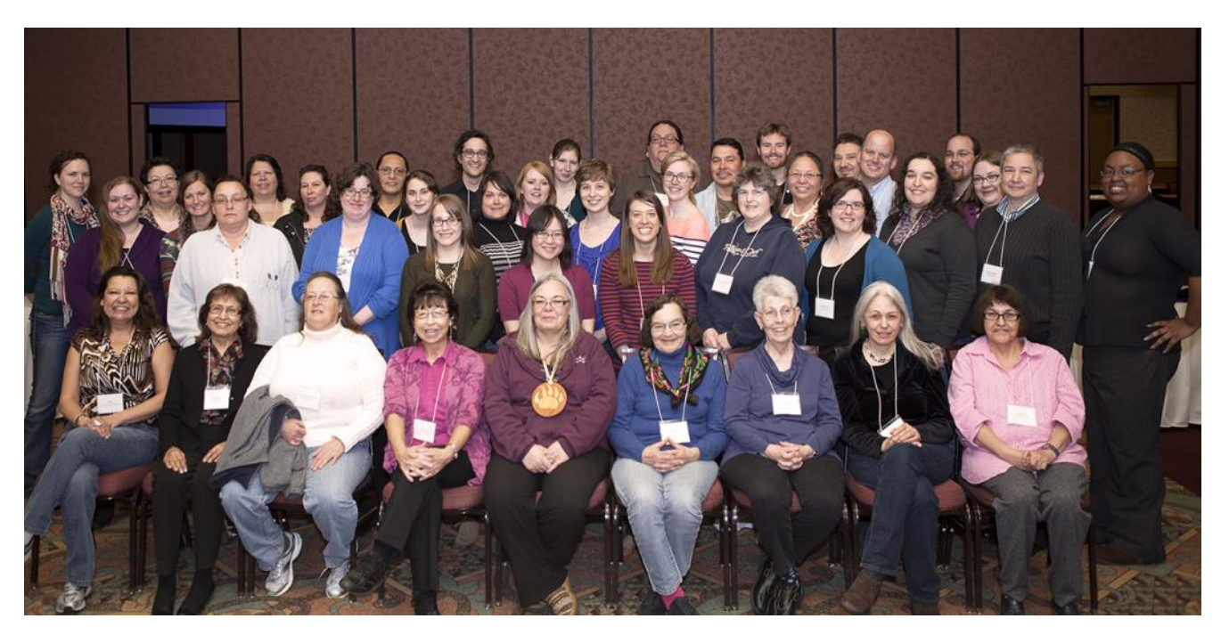
Photo: Culture Keepers at Lac du Flambeau, Wisconsin, May 2, 2013.